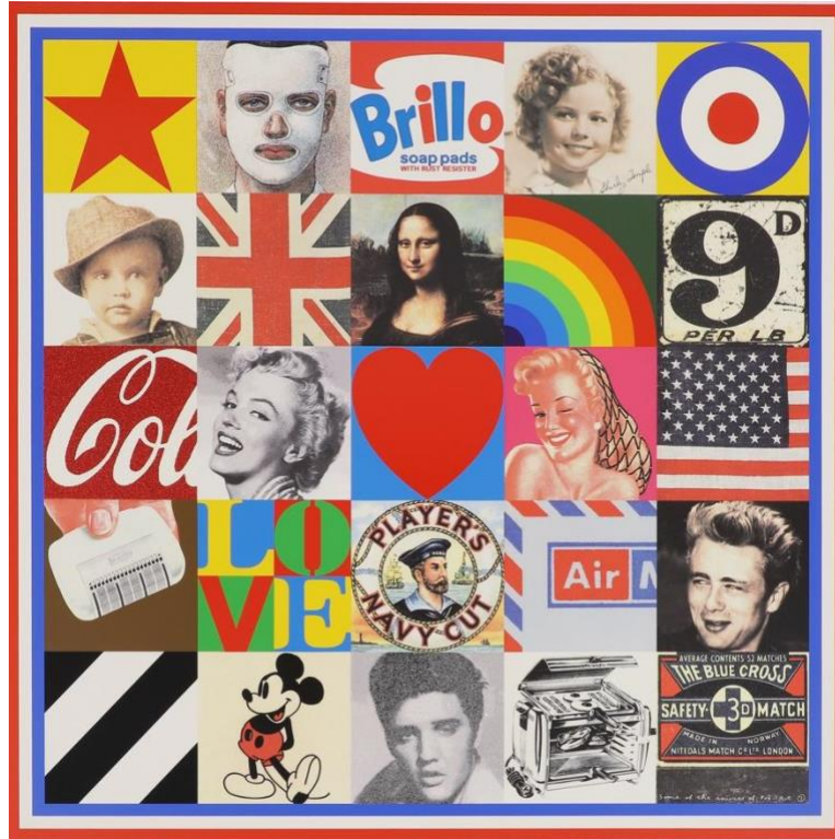
Peter Blake, Sources of Pop 7 ed 175 , 1010 x 1060mm. For Arts Sake. © Peter Blake, courtesy of CCA Galleries Ltd.