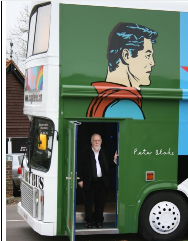
Sir Peter Blake and his Art Bus.